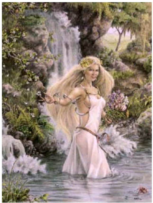
@ 1082 9Y LIGA HUNT ALL RIGHTS RESERVED

Healers must learn their spells as do magicians. They have the same bonuses and penalties as magicians for high and low Intelligence. Like a magician, the healer must keep spell books of all the spells they know.